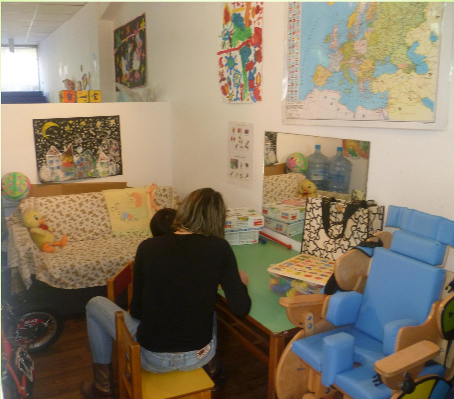
Speech therapy sessions