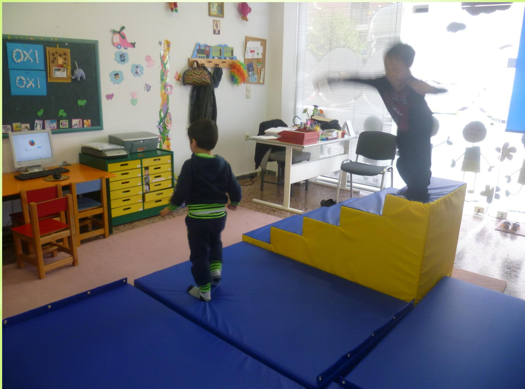
Movement therapy sessions