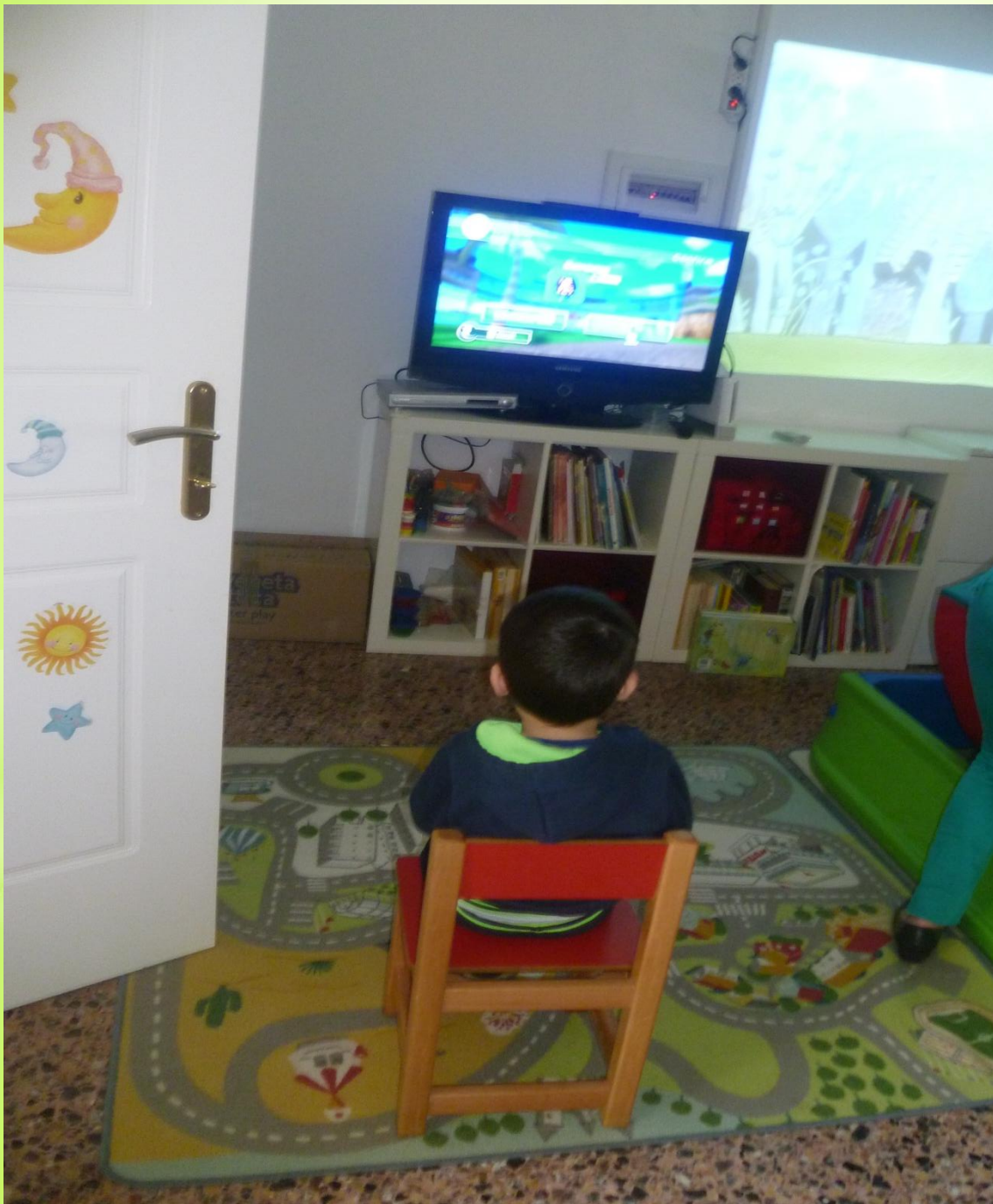
Our Wii station