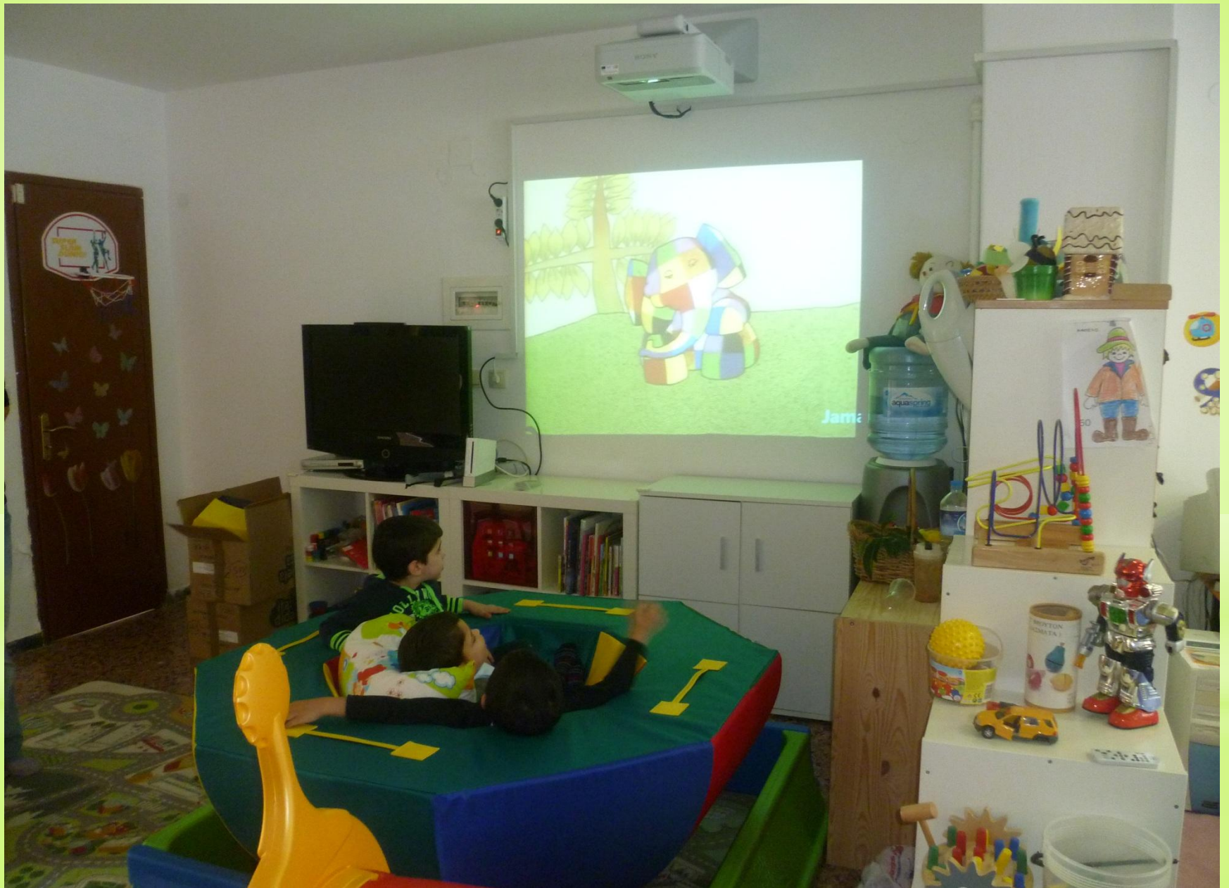
Interactive whiteboard activities