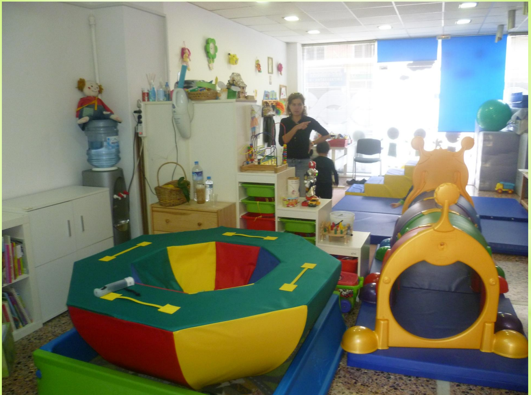
Inverted fungi area for passive vestibular therapy