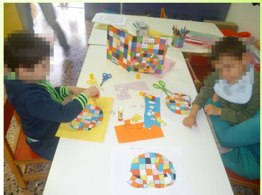
Working on the Elmer project