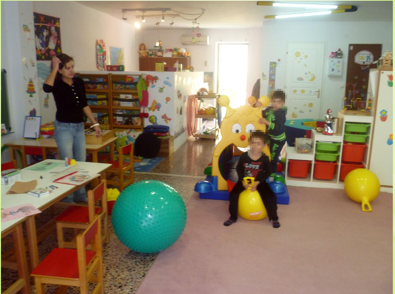
Photos from the Nursery's interior