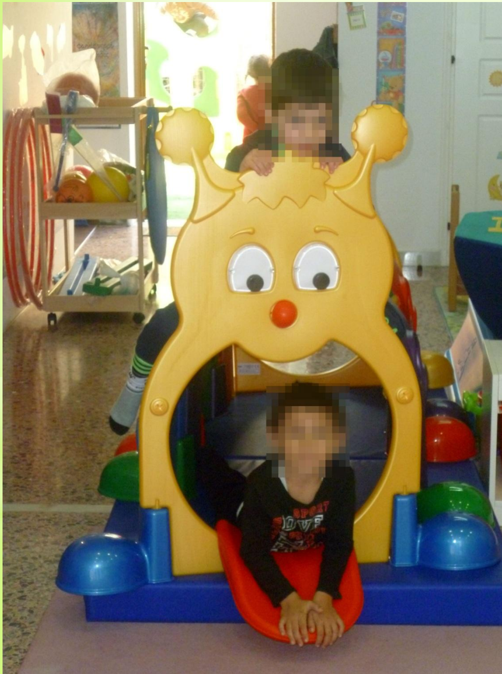
Our notorious caterpillar!