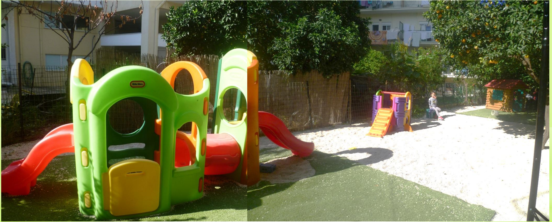
Our outdoors play yard